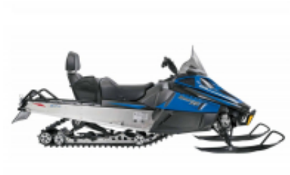
Bearcat XT + $0.00