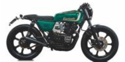
KZ550 Caferacer + $352.07