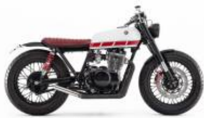
XS 400 + $0.00