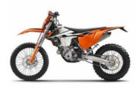
EXC 350 + $686.18