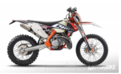
300 2T six days + $686.18