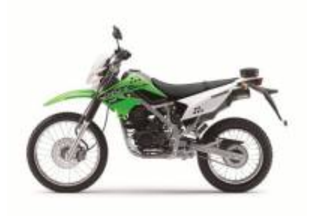
KLX 150 + $0.00