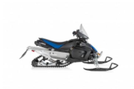
Viking 700 + $0.00