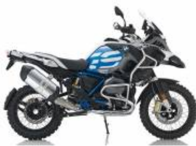
R 1200 GS Adv + $164.16