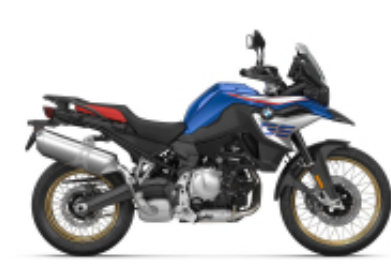
F 850 GS + $702.37