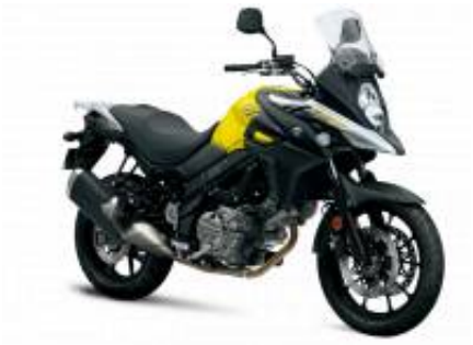
DL 650 V Strom + $70.00