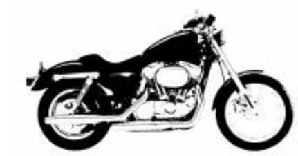
Rally 300 + $0.00