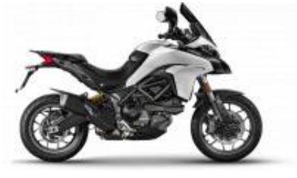
Multistrada 950 + $930.54