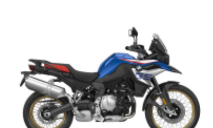
F 850 GS + $930.54