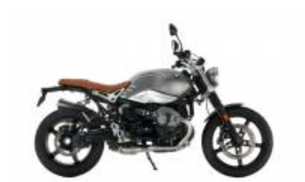
R nineT Scrambler + $930.54