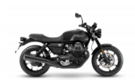
V7 Stone 800 + $814.23