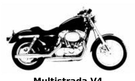
Multistrada V4 + $1,163.18