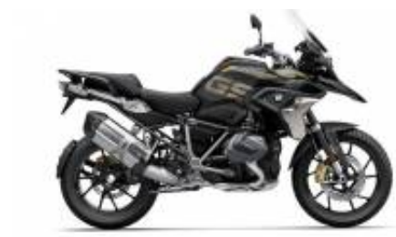
R 1250 GS LC + $1,163.18