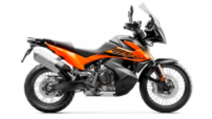
890 Adventure + $0.00