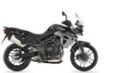
Tiger 800 XRX + $0.00