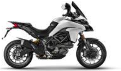
Multistrada 950 V2 + $0.00