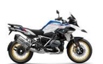
R 1250 GS HP Edition + $0.00