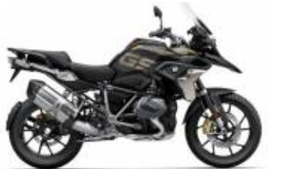
R 1250 GS LC + $0.00