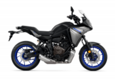
Tracer 700 + $58.45