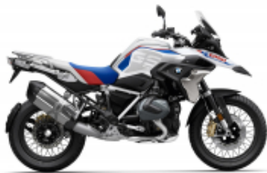
R 1250 GS + $987.42