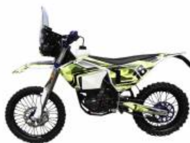
Rally 450 + $0.00