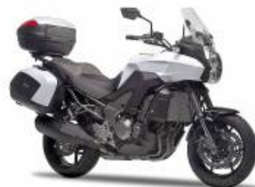
Versys 1000 Grand Tourer + $570.70