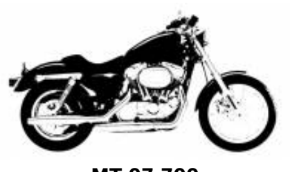
MT 07 700 + $0.00