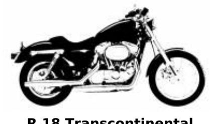
R 18 Transcontinental + $676.65