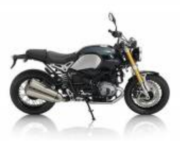
R Nine T Pure + $174.19