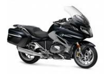
R 1250 RT LC + $522.57