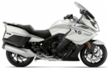
K 1600 GTL + $701.45