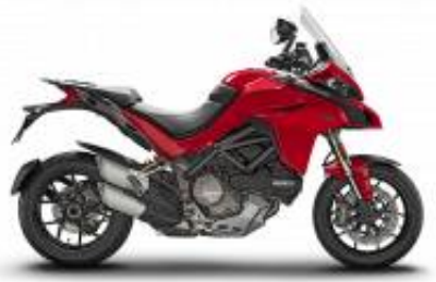
Multistrada 1260 + $582.32