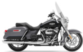
Road King Street Classic Class + $701.45