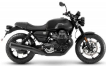
V7 Stone 800 + $0.00