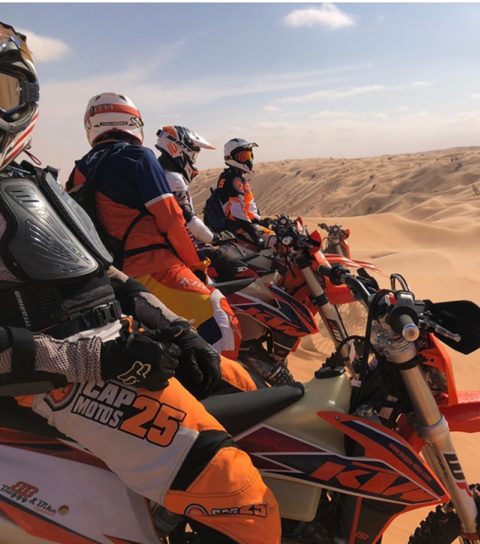
Motorcycle Enduro off road Tunisia Sahara desert