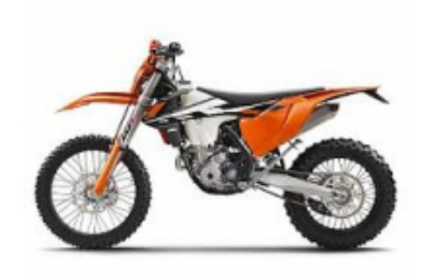
EXC 350 + $686.28