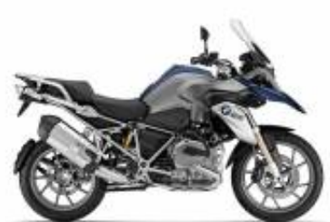
R 1200 GS + $419.92