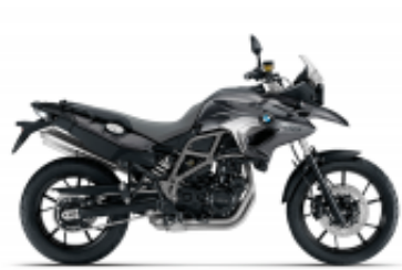
F 700 GS + $0.00