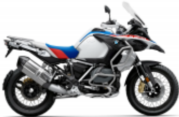
R 1250 GS Adventure + $174.19