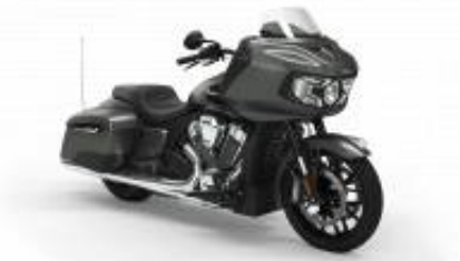
Challenger Street Touring Class + $180.00