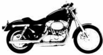
Road Glide Street Touring Class + $180.00