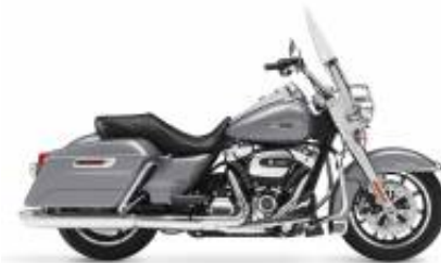
Road King (Gen) Cruiser Touring Class + $120.00