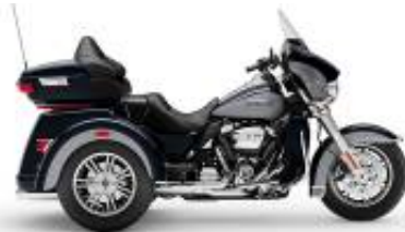
Trike Tri Glide (Gen) + $780.00