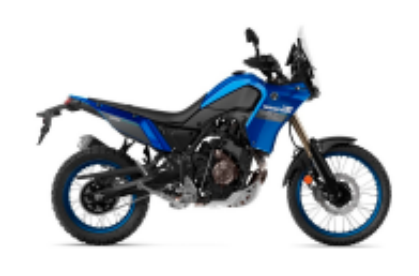
Tenere 700 + $70.79