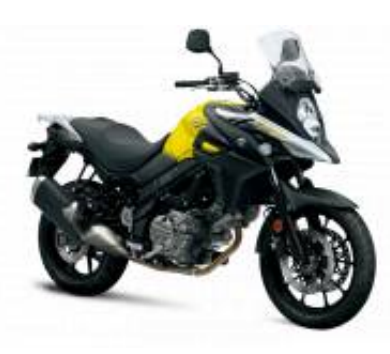
DL 650 V Strom + $0.00