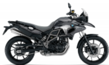
F 700 GS + $198.19