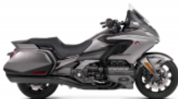
Goldwing DCT 2018 + $604.97