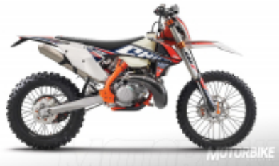
300 2T six days + $683.66