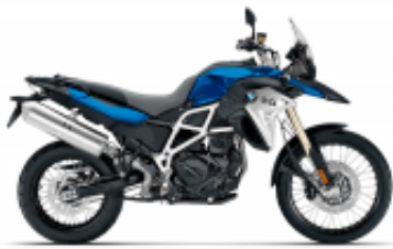
F 800 GS + $85.22