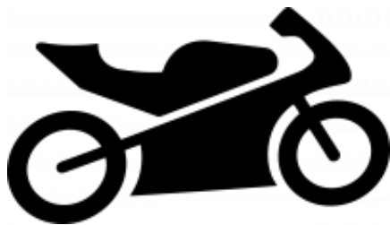
My own motorbike + $0.00