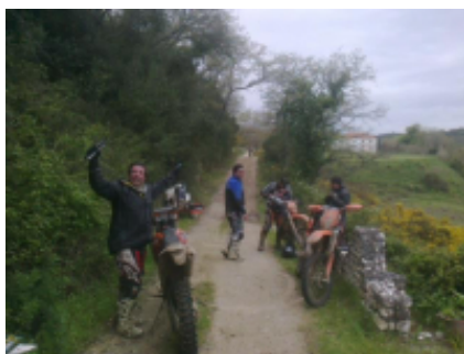
2 - Santarem - Santarem - 160 km