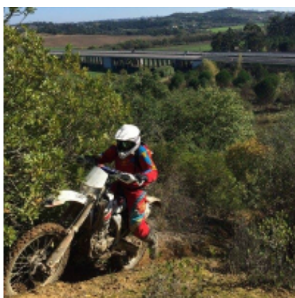
5 - Santarem - Santarem - 140 km