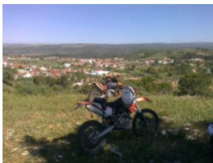
3 - Santarem - Santarem - 150 km