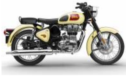
Classic 500 + $0.00