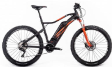
Graveler Sport Drive 10V 27,5 20.ETM.30