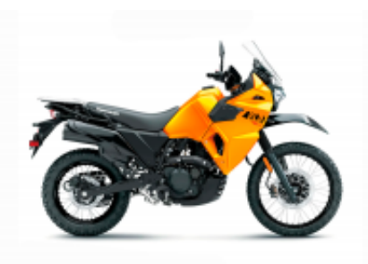
KLR 650 + $640.00