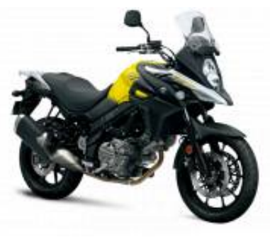
DL 650 V Strom + $990.00