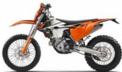
EXC 350 + $0.00