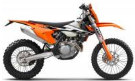
EXC 450 + $0.00