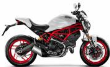
Monster 797 + $408.06