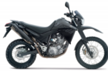
XT 660 R + $1,027.63