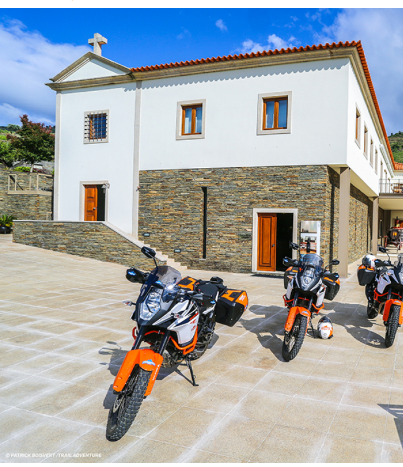
3 Days Motorcycle dual-purpose and Adventure - Porto and Douro Valley - Self-Guided