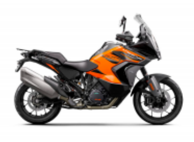
1290 Super Adventure S + $0.00