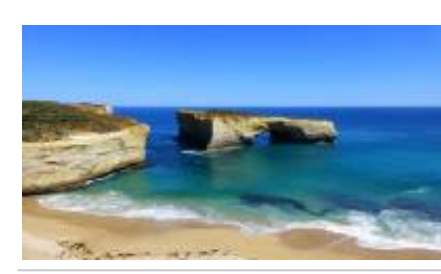
2 - Great Ocean Road - Grampians -