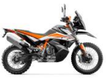
790 Adventure + $524.65