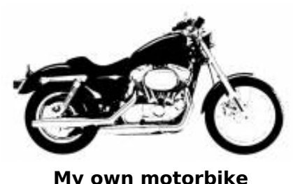
My own motorbike + $0.00