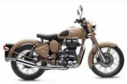
Classic Desert Storm 500 + $0.00