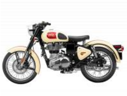
Tan 350 + $0.00