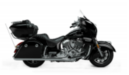
Roadmaster 1890 Grand Touring Class + $678.29