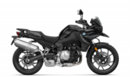
F 750 GS + $0.00