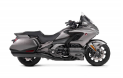
Goldwing DCT 2018 + $678.29