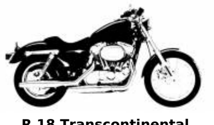
R 18 Transcontinental + $678.29