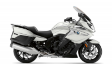
K 1600 GTL + $678.29