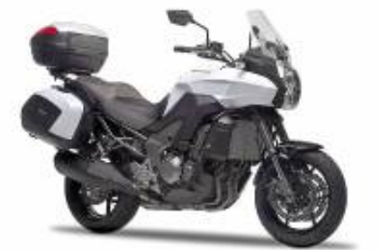
Versys 1000 Grand Tourer + $336.23