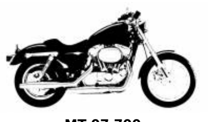
MT 07 700 + $0.00