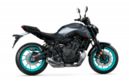
MT 07 700 (A2) + $0.00