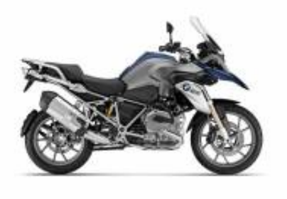
R 1200 GS + $82,000.00