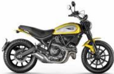
Scrambler Icon 800 + $294.98