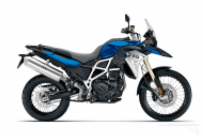
F 800 GS + $0.00