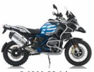
R 1200 GS Adv + $280.76