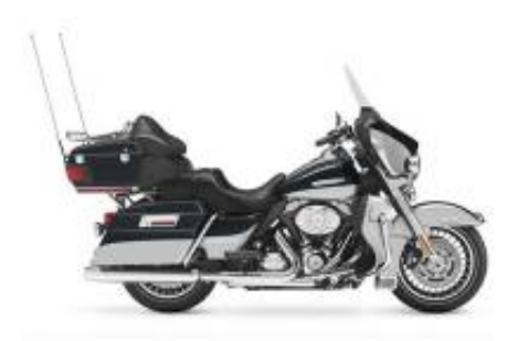
Road Glide Ultra Grand Touring Class + $959.91