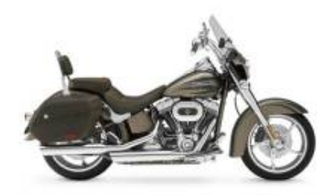
Softail + $959.91