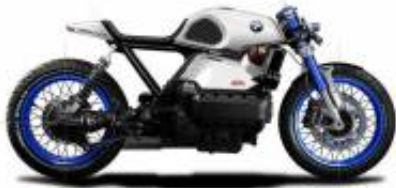
K75 Cafe Racer + $0.00