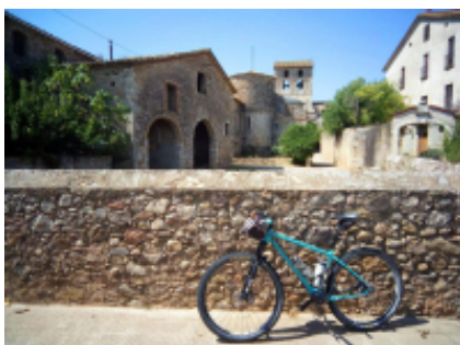
6 - Banyoles - Girona - 31