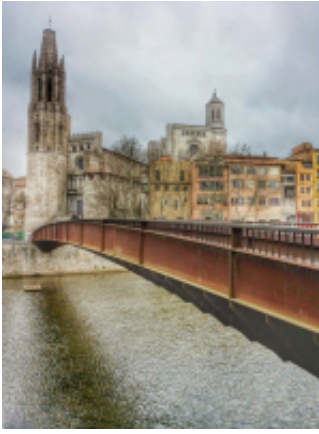
7 - Girona - Girona - 0