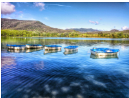
5 - Besalú - Banyoles - 36