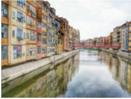
1 - Girona - Girona - 0