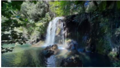
2 - Girona - Les Preses - 60