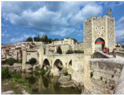
4 - Olot - Besalú - 44