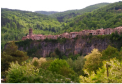
3 - Les Preses - Olot - 41