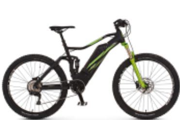
Graveller Sport Drive 10v 27,5 20.ETM.20 + $76.63