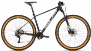
XC 879 + $17.70