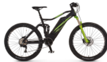
Graveller Sport Drive 10v 27,5 20.ETM.20