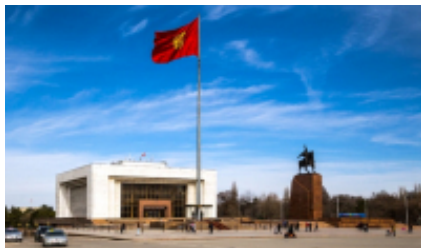
1 - Biškeek - Biškeek - 0