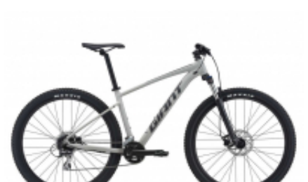
Talon 2 29 + $186.79