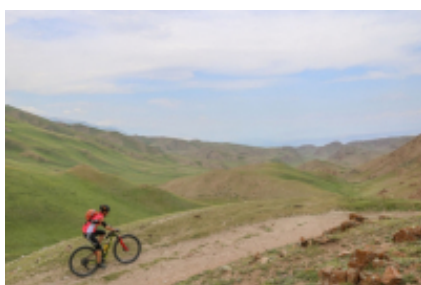
3 - Biškeek - Kegeti - 65