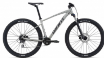
Talon 2 29 + $188.37