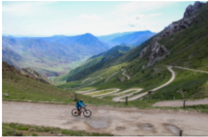
2 - Biškeek - Biškeek - 50