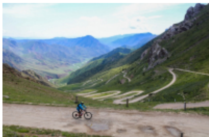
2 - Biškeek - Biškeek - 50