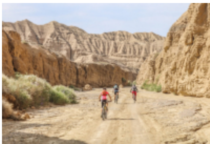
8 - Bökönbaev - Bökönbaev - 60