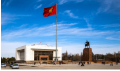
1 - Biškeek - Biškeek - 0