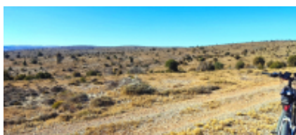
6 - Villel - Albarracín - 56