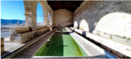
9 - Barcellona - Barcellona - 0