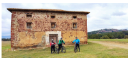
7 - Albarracín - Teruel - 37