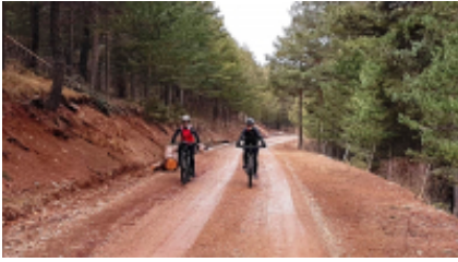
8 - Teruel - Barcellona - 0