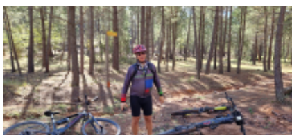
5 - Mora de Rubielos - Villel - 64