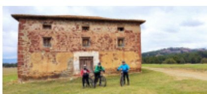
7 - Albarracín - Teruel - 37