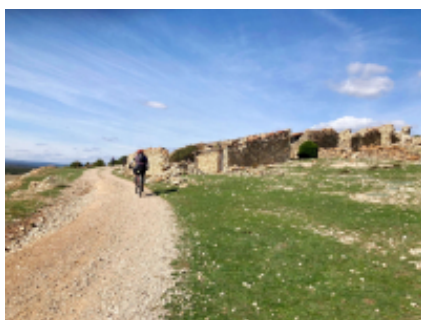
2 - Teruel - Alcalá de la Selva - 60