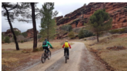
4 - Mosqueruela - Mora de Rubielos - 67