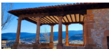
3 - Alcalá de la Selva - Mosqueruela - 54