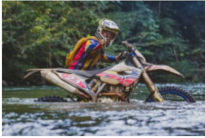
1 - Bogotá - Villa de Leyva - 0