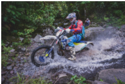
4 - Pacho - Villeta - 130