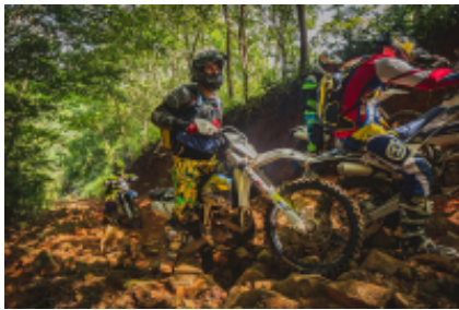
2 - Villa de Leyva - Ubaté - 100