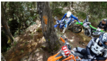
5 - Villeta - Honda - 150