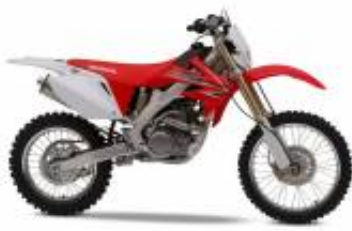
CRF 250 + $0.00