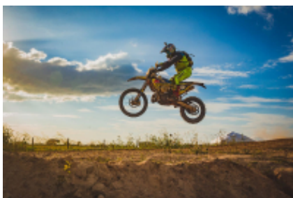
6 - Honda - Honda - 0